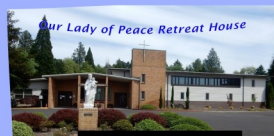
Our host sites: